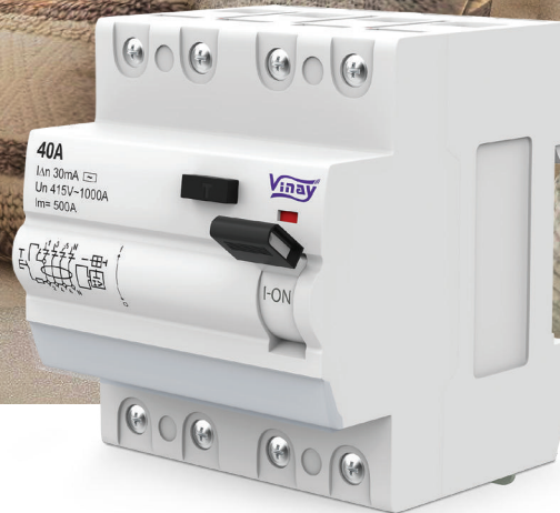
RESIDUAL CURRENT CIRCUIT BREAKER (RCCB)- FOUR POLE