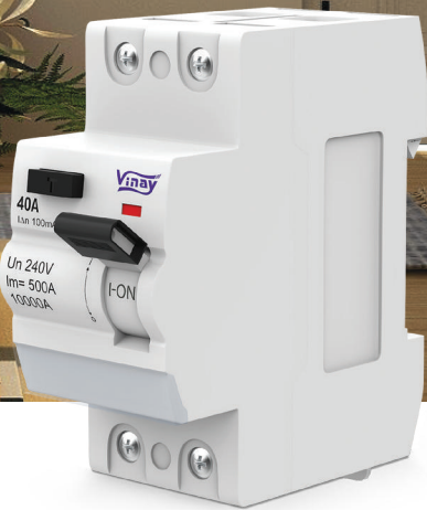
RESIDUAL CURRENT CIRCUIT BREAKER (RCCB)- DOUBLE POLE