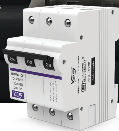
MINIATURE CIRCUIT BREAKER - TRIPLE POLE (10kA C SERIES)