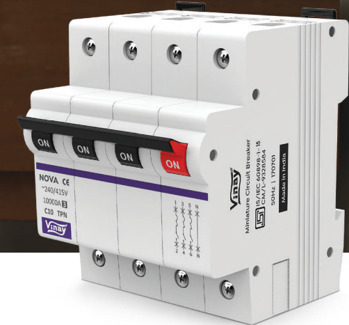
MINIATURE CIRCUIT BREAKER - THREE POLE NEUTRAL (10kA C SERIES)