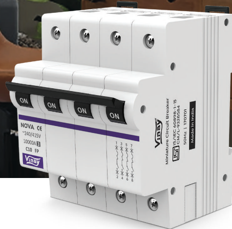
MINIATURE CIRCUIT BREAKER - FOUR POLE (10kA C SERIES)