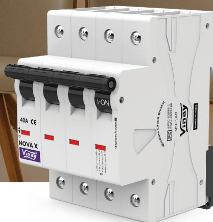
MINIATURE CIRCUIT BREAKER - FOUR POLE ( 10kA C SERIES )