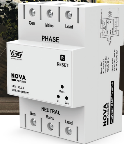
AUTOMATIC CHANGEOVER- SINGLE POLE NEUTRAL (ACCL)