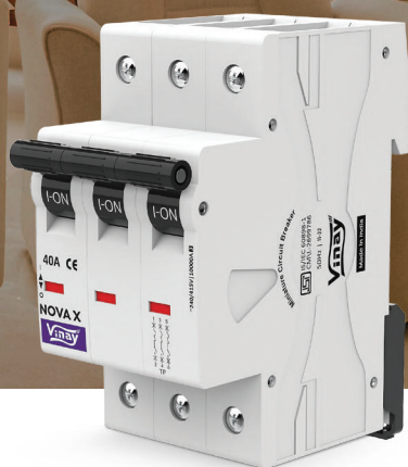
MINIATURE CIRCUIT BREAKER - TRIPLE POLE ( 10kA C SERIES )