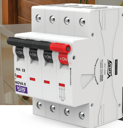
MINIATURE CIRCUIT BREAKER - THREE POLE NEUTRAL ( 10kA C SERIES )